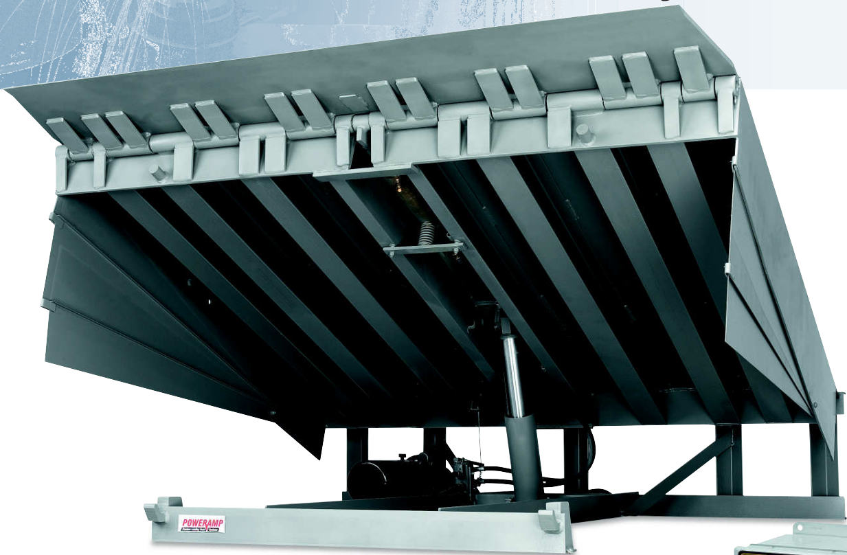
VH Series 7'x 8' 50,000 CIR with Conventional Frame shown.