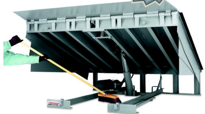
VH Series 7' x 8' 35,000 CIR with CleanSweep Frame™ shown.