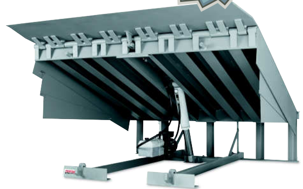
EH Series 7'x 8' 50,000 CIR with CleanSweep Frame™ shown.

The EH Leveler is powered by a heavy-duty 1.5 horsepower (TEFC) motor. The manifold incorporates a cartridge valve assembly that simplifies field adjustments and improves reliability. A translucent tank facilitates "at a glance" fluid level inspections.