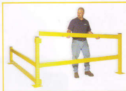
INSTALLS IN MINUTES