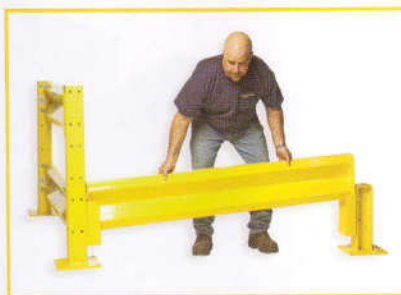
LIFT OUT RAIL OPTION

Improve plant safety and efficiency with Crash Guard™ by reducing the costs associated with employee injury, machinery down time, insurance claims, and building repairs due to accidental collisions.