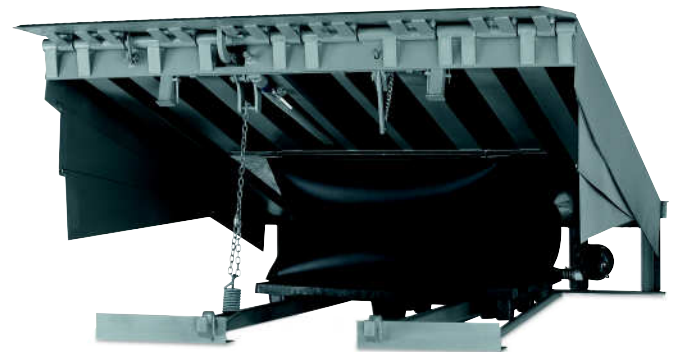
AP Series 7x 10' 50,000 CIR shown.

Pound for pound, the deck and sub-frame structure of the AP Series Leveler is superior to competitive models and will provide you with years of reliable service.